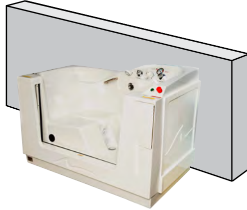
BACK WALL INSTALLATION This installation requires additional Left and Right Side Panels*