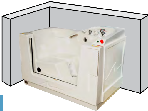
LEFT CORNER INSTALLATION This installation requires additional Right Side Panel*