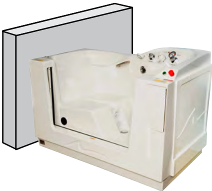
LEFT WALL INSTALLATION This installation requires additional Back and Right Side Panels*