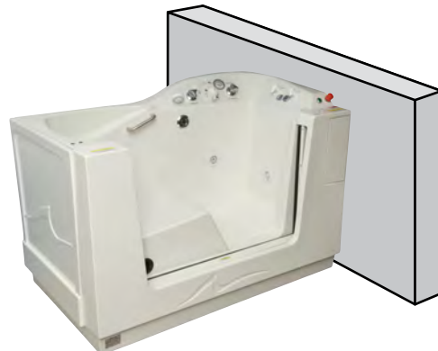
RIGHT WALL INSTALLATION This installation requires additional Back and Left Side Panels*

*Please refer to quote and denote any additional panels needed for desired configuration