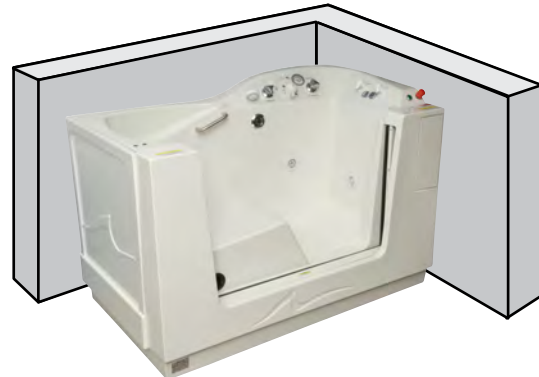
RIGHT CORNER INSTALLATION This installation requires additional Left Side Panel*